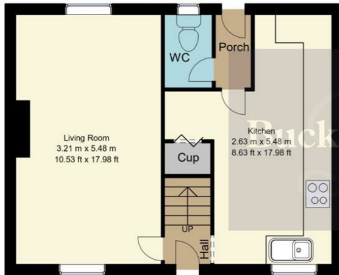
Ground Floor 40sq.m/435.62sq.ft Approx